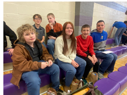
Clockwise from Top R: The Elementary-Junior High places 1-3 County Spelling Bee. Bottom R: Some of the Scholars Bowl Team students chilling, awaiting their first place award.