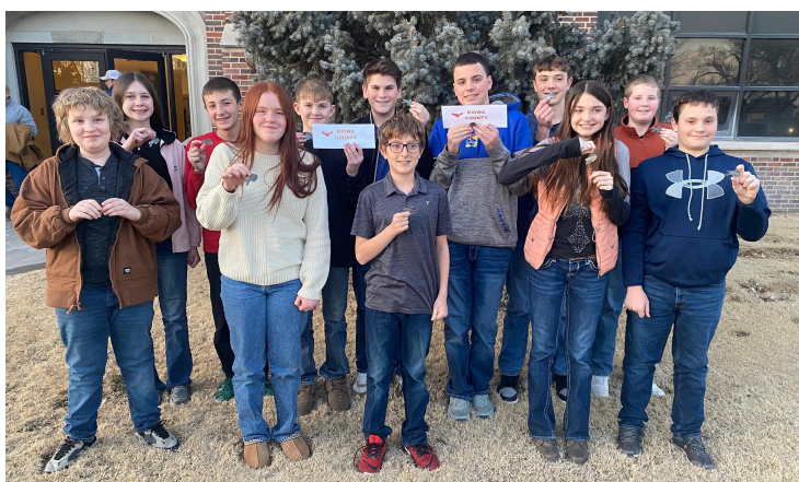
Top: The Kiowa County Varsity Quiz Bowl prepares for Round 2 against Spearville. Bottom: The KCJH Varsity and Junior Varsity show off their medals after the Meade Meet.