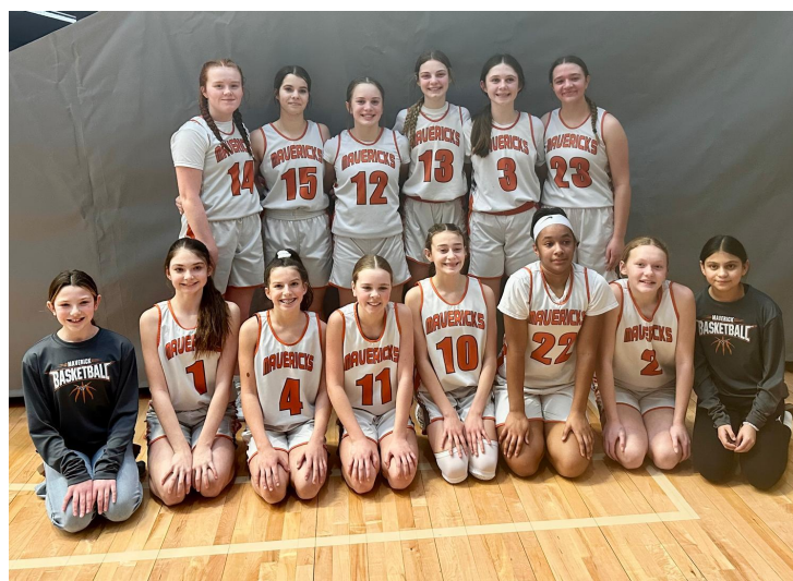
The Lady Mavericks gather for a picture after the SPIAA League Tournament, where they placed 4th. (courtesy photo)