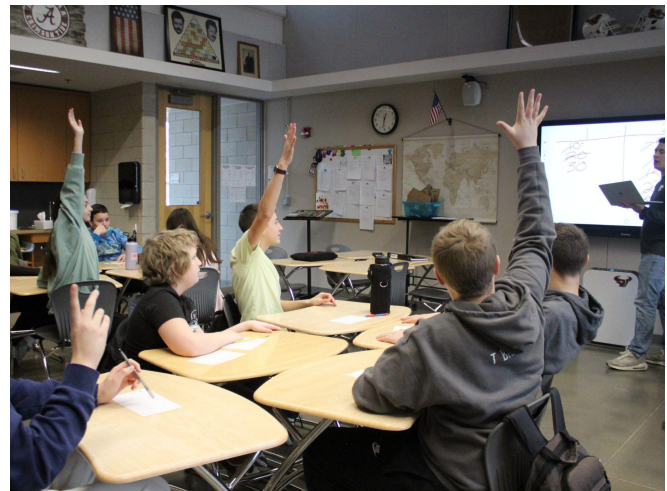
The Junior High Quiz Bowl Team answer some math questions during practice. 4