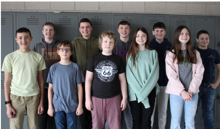
Top: The Scholars Bowl team split into two groups, battling to see who can answer the question first. Bottom: The 2025 Kiowa County Junior High Scholars bowl team.