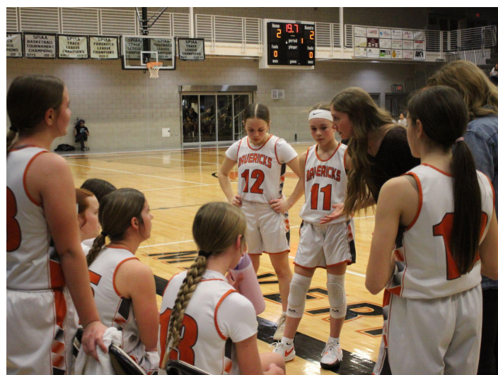
The Lady Mavericks take a timeout to discuss their plays against the South Central Timberwolves.